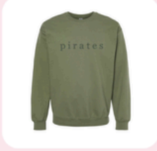
Military Green with Dark Green