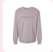
Paragon with Mauve