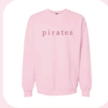
Light Pink with Dark Pink