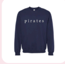
Navy with White