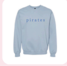
Stone Blue with Dark Blue

Sweatshirts will be delivered to your child's school when the orders are completed. If you do not have a child in PPSD but would still like to order, list the Student's Teacher Name as E. Jostes, and you can pick up at PHS. *Note that your sweatshirts may vary slightly in color due to dyes and batches, but the images attached are mockups provided by the embroiderer and should not differ much if at all.*