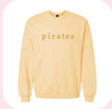
Yellow Haze with Dark Yellow