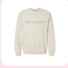
Sand with Taupe