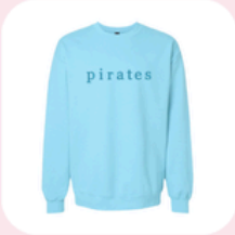
Sky with Teal